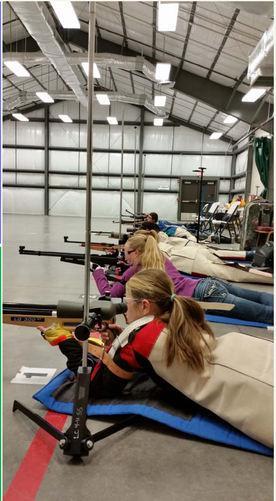
Wyoming USA Shooting Junior Olympic Match Competitors doing their thing. 😊 Jan 2016

We in American do not have a government by the majority. We have a government by the majority who participate. Thomas Jefferson