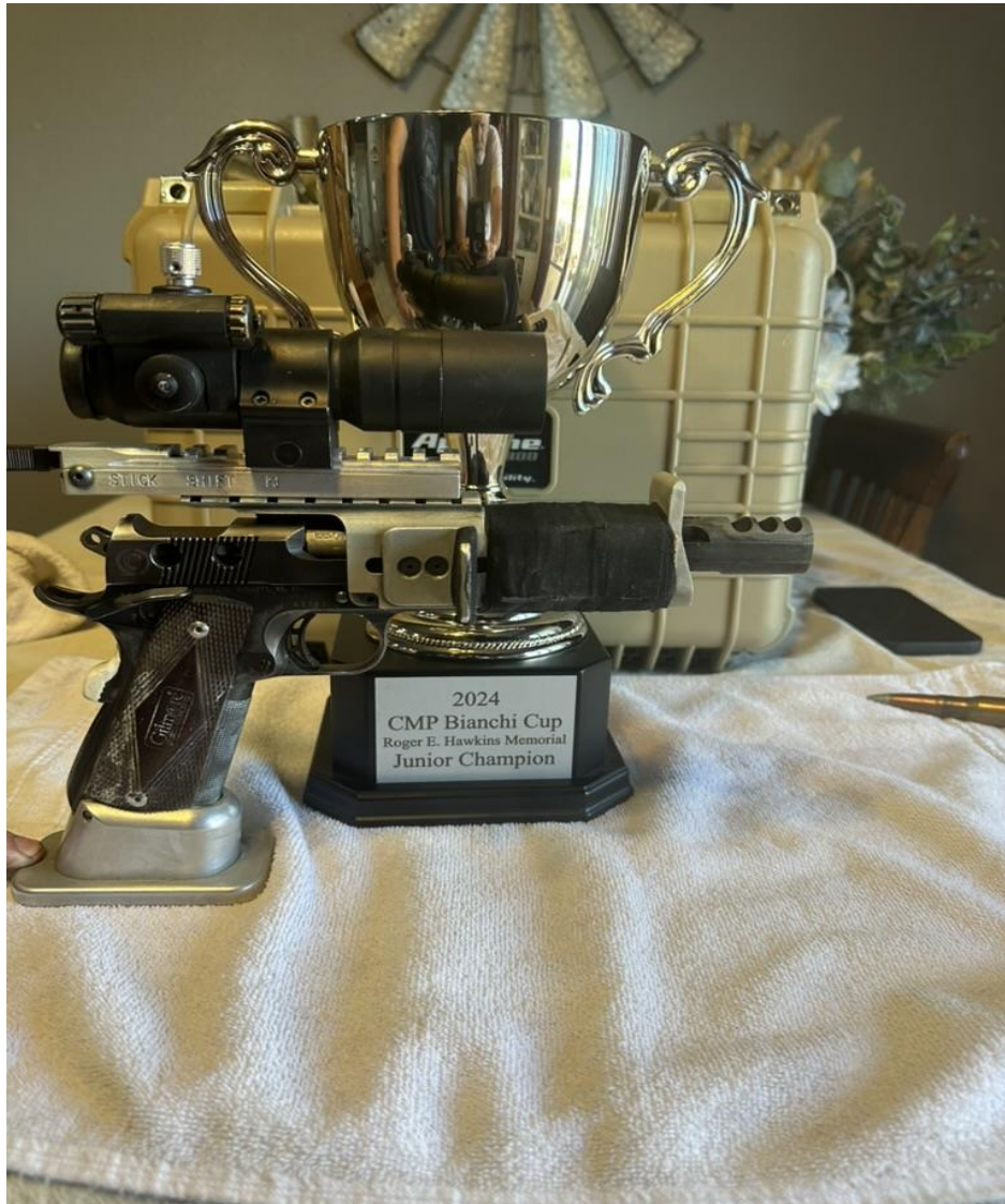
Championship Firearm: Caspian Custom 1911, .38 Super